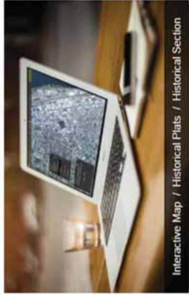
Interactive Map / Historical Plats / Historical Section